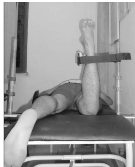
Fig. 1 Participant's position for hip external rotation (ER) isometric torque assessment.

The examiner positioned the hand-held dynamometer (Microfet2®) using a rigid strap to eliminate measurement bias (examiner force application during the test). The dynamometer's strap was anchored to a metal rod placed perpendicular to the table (Fig. 1). Another stabilization strap was fixed around the pelvic region of the athlete to avoid pelvic movement. The dynamometer was positioned five centimeters proximal to the medial malleolus and the rigid strap limited hip external rotation range of motion (ROM).