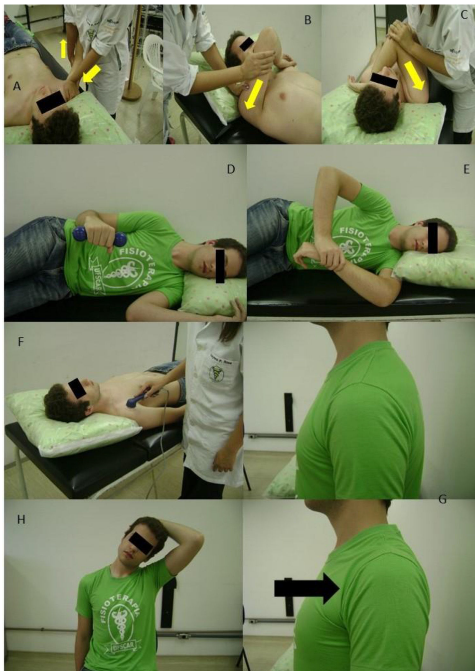
Fig. 2 Protocols for the groups: Experimental group: A, B, and C) Progression of posterior capsule mobilization (arrows indicate the mobilization directions), D) Strengthening of the external rotators, E) Posterior capsule stretching; Comparison group: F) Sham ultrasound, G) Scapular squeezing exercise, H) Stretching of the upper trapezius.

scapular retraction, and upper trapezius (UT) stretching. Participants received five minutes of sham ultrasound to the anterior shoulder in supine (Fig. 2F). Afterwards, they completed three sets of 10 repetitions of isotonic scapular retraction exercises without external resistance by squeezing both scapulae together while sitting (Fig. 2G). The UT stretching was performed three times while sitting. Participants flexed and rotated their cervical spine to the opposite side and same side, respectively, of the ipsilateral UT, 48 and held this position for 30 seconds with 30-second rests between repetitions (Fig. 2H).