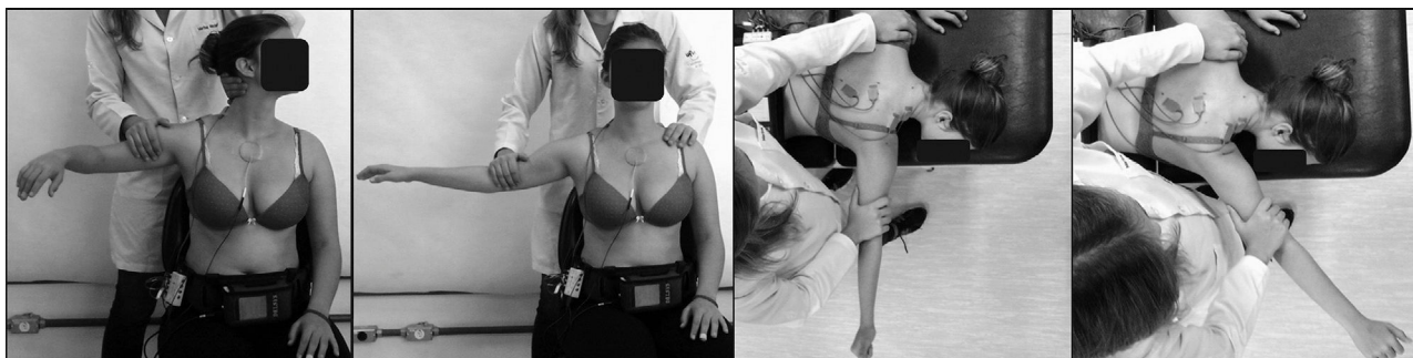
Figure 1 Test positions during maximal and submaximal muscle contractions for the upper-clavicular fibers (a), upper-acromial fibers (b), middle (c), and lower (d) trapezius. Manual resistance was applied for maximal voluntary contractions, as shown in the pictures. The same positions were used for submaximal voluntary contractions with subjects holding a halter of 1 kg.

The within- and between-days reliability, which may be analyzed in order to determine how much a measure are equal, considering repeated measurement in different occasions, 48 was evaluated through the Intraclass Correlation Coefficient, the coefficient of variation (%CV), the standard error of the measurement (SEM and %SEM) and the Bland–Altman analysis. All the tests were run in SPSS (Statistical Package